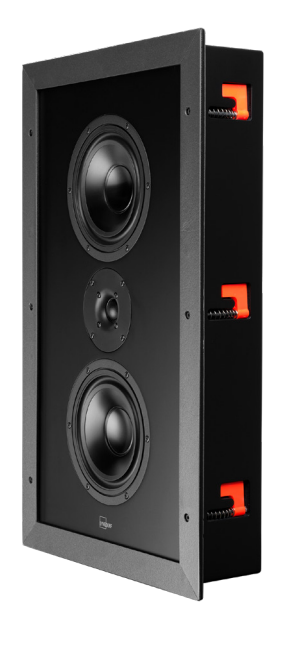
Lyngdorf D-500 Center

Full-range custom installation in-wall speaker with closed cabinet